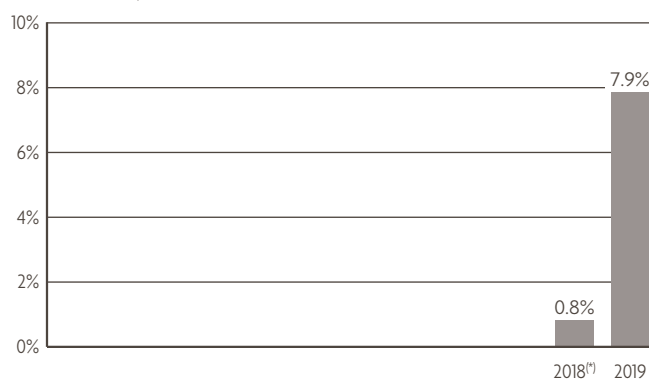
Series I Units – Annual return for the period ended December 31, 2019

(*) for the period of October 19, 2018 to December 31, 2018.