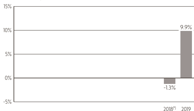
Series A Units – Annual return for the period ended December 31, 2019

(*) for the period of October 19, 2018 to December 31, 2018.